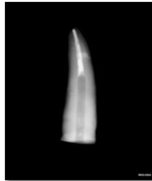
Figure 2: Radiograph after Post Space Preparation

The posts were then cemented into the tooth using a resin sealer. The post cemented roots were then stored in saline solution at room temperature and acrylic resin cylinders were obtained using cylindrical molds. Then the specimens were mounted on the lower plate of the Universal Testing Machine and a compressive loading was applied vertically to the coronal surfaces of the roots with a loading rate of 1mm/min until fracture occurred and the load at which failure has occurred was recorded and expressed in Newton. Data was statistically analyzed and descriptive statistics, including the mean, standard deviation, standard error were obtained. Significance of statistical test was predetermined at P < 0.05 .