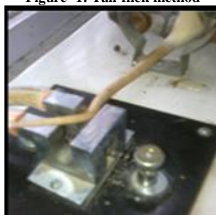
Figure- 1: Tail-flick method

Appropriate dosage of drugs according to weight were given and Tail Flick Latency (TFL) was tested at 15, 30, 60 min. The basal reaction time was taken immediately after giving the drug at zero minute by keeping the tail on nichrome wire. The time taken for the withdrawal of the tail was considered as tail flick latency. Antinociceptive activity was measured at 0, 15, 30, 60 min. The antinociceptive activity was considered as positive if rat fails to withdraw the tail within 10 seconds of exposure to avoid damage to tail (Figure- 1).