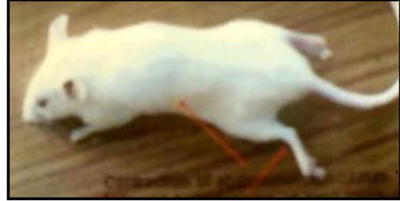
Figure- 1: Writhing phenomenon

Table 1 showing the 30 rats divided into five groups (Group I to Group V) n=6 with drugs and the dosage used.