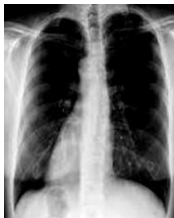
Figure 1: PA view of chest (Dextrocardia)